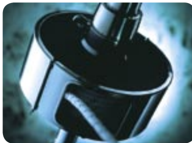
▶ RS2000 Reefing System

We've developed the RC 30 and RC40 carbon systems for sailors, who up to now have operated a Tuff Luff racing forestay system in addition to their standard roller reefing system in order to satisfy their racing ambitions. They were developed to eliminate the need for cumbersome retrofitting prior to each race. They are designed for yachts from approx. 42 to 68 feet with forestay lengths up to about 30 metres. As one meter of the double groove carbon profile weighs only from 0.327 kg (S2) to 0.77 kg (S4), the entire system is so light that it weighs even less than the corresponding racing profile forestay system. The RC 30 and RC 40 are hence very light reefing systems for cruising and you no longer require any other system for racing.