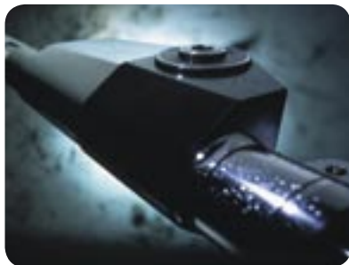
▶ RF90 Reefing Hydraulic System