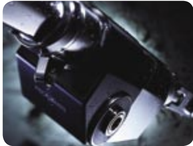
▶ EF90 Electric Reefing System